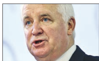
Gov. Tom Corbett's lawsuit was in response to the sanctions levied against Penn State University.